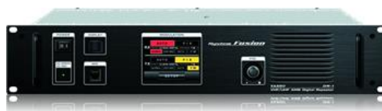
LC Echo 440 Repeater Yaesu DR-1X 442.925 MHz 100 HZ PL