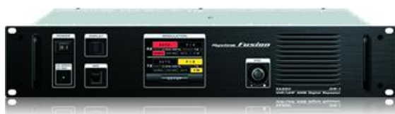
LC Echo 2 Meter Repeater Yaesu DR-1X 147.080 MHz 100 HZ PL

Doug Chauvin, N8PYN 29112 Elmwood St. St Clair Shores, MI 48082 (586) 775-1891 dougn8pyn@ameritech.net